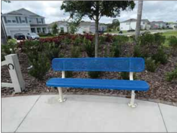
Tucson Wind/Sweet Springs Park Benches