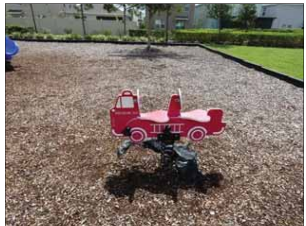
Balboa Mist/Weathered Windmill Riding Structures