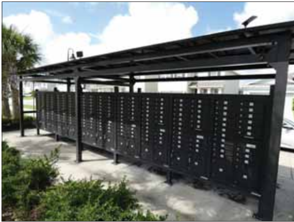
Living Coral/Sea Canary Metal Mail Pavilion