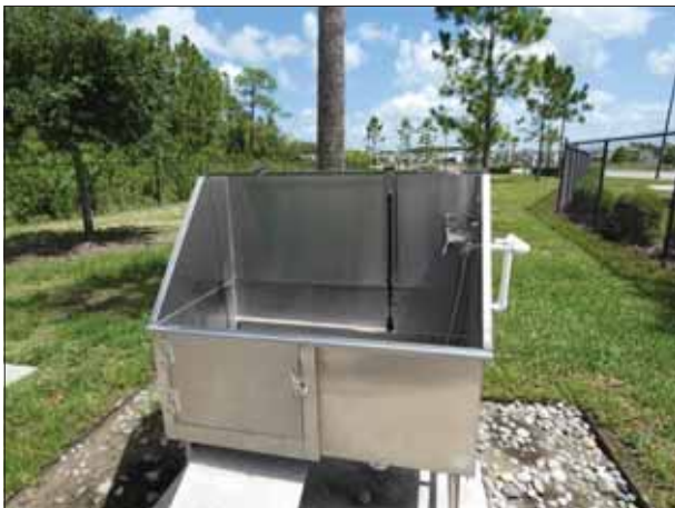
South Branch Blvd Dog Park Wash Station