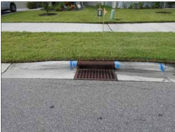
Stormwater Drainage Curb Inlet