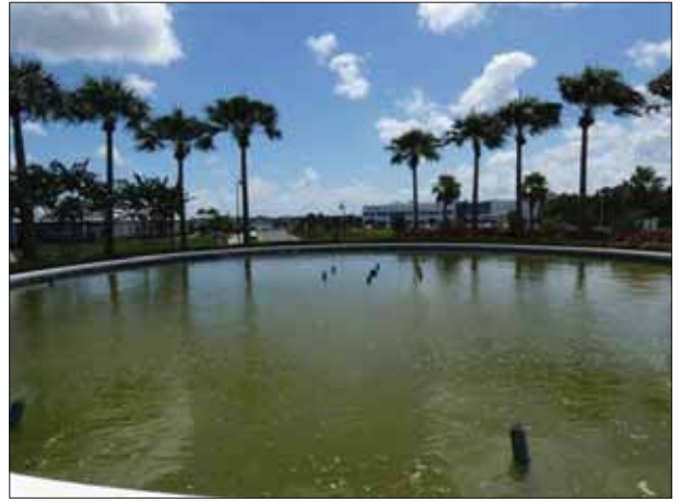
Roundabout Fountain Pool