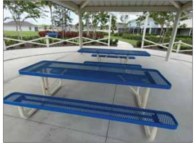
Tucson Wind/Sweet Springs Picnic Tables