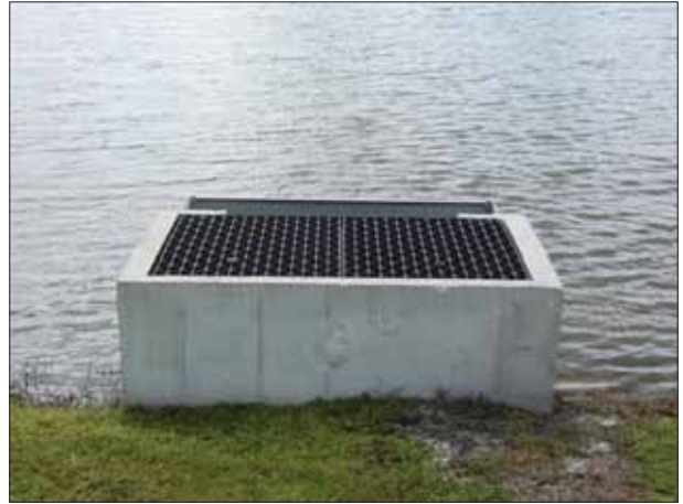
Stormwater Drainage Control Structure