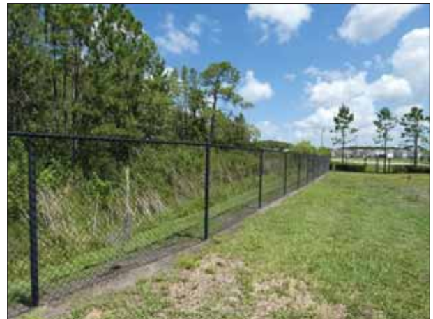
South Branch Blvd Dog Park Fencing