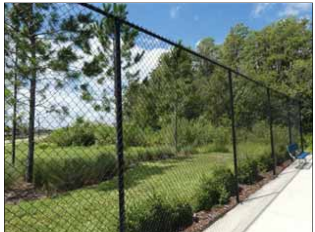
South Branch Blvd Basketball Court Fencing