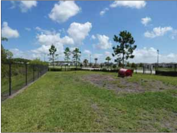
South Branch Blvd Dog Park