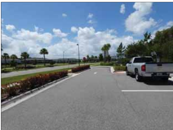
South Branch Blvd Park Parking Lot