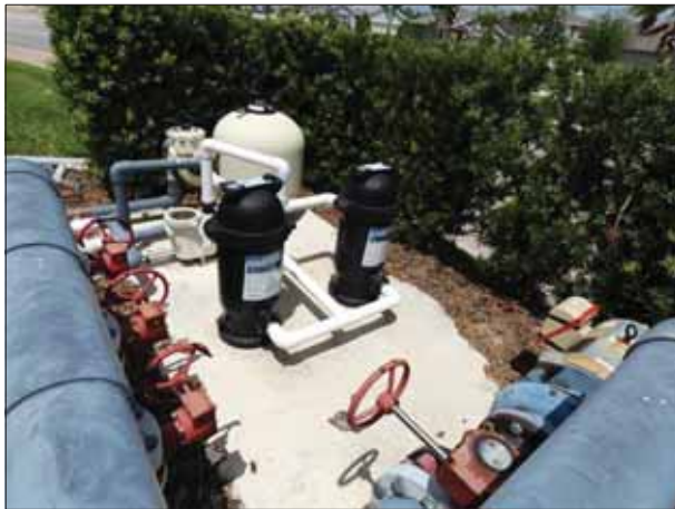
Roundabout Fountain Pool Pumps and Equipment