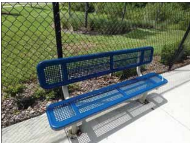
South Branch Blvd Basketball Court Park Benches