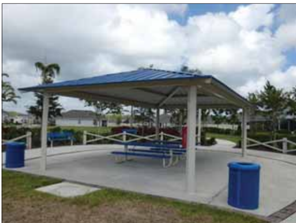
Tucson Wind/Sweet Springs Park Pavilion