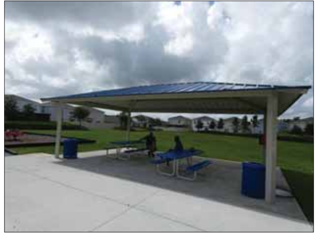
Balboa Mist/Weathered Windmill Park Pavilion