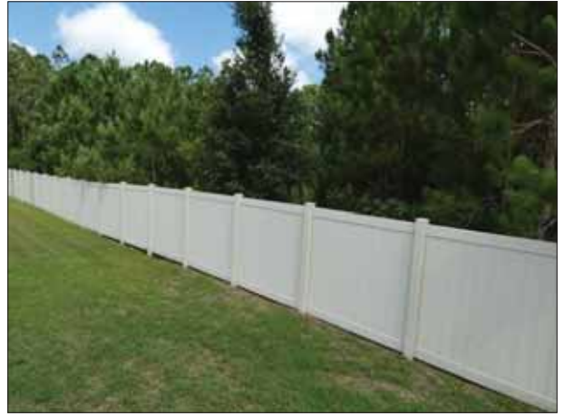
Perimeter Vinyl Fencing Northern Boundary