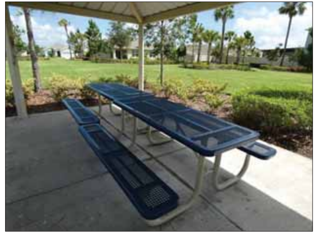
Living Coral/Sea Canary Metal Park Pavilion Picnic Table