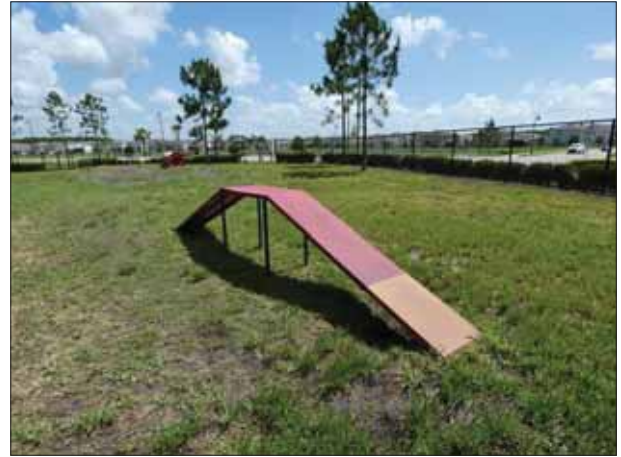
South Branch Blvd Dog Park Obstacle