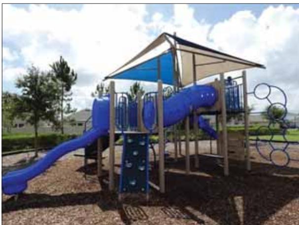
Balboa Mist/Weathered Windmill Playstructure