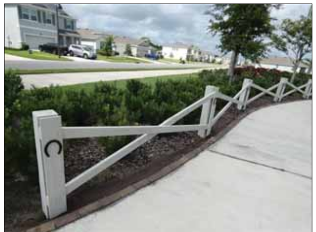
Tucson Wind/Sweet Springs Wooden Fencing