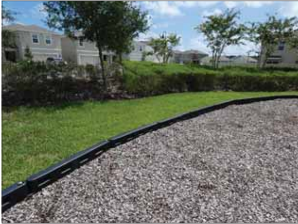
Balboa Mist/Weathered Windmill Playground Edging