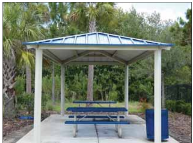
South Branch Blvd Metal Pavilion