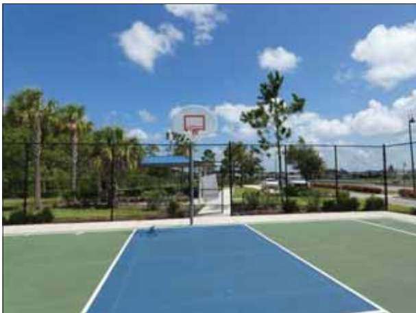
South Branch Blvd Basketball Court